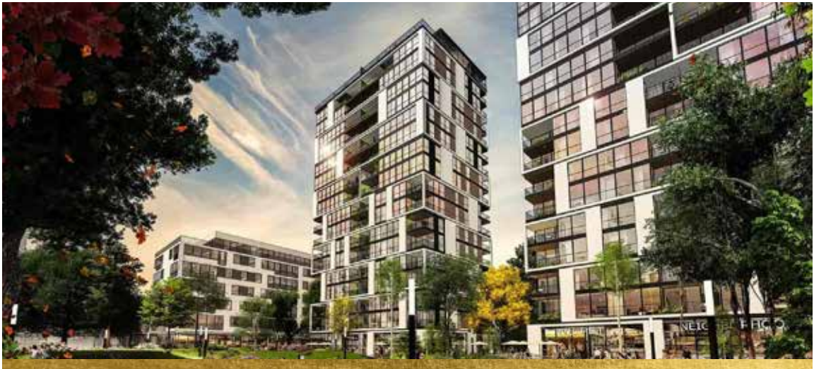
MOMA TEL AVIV