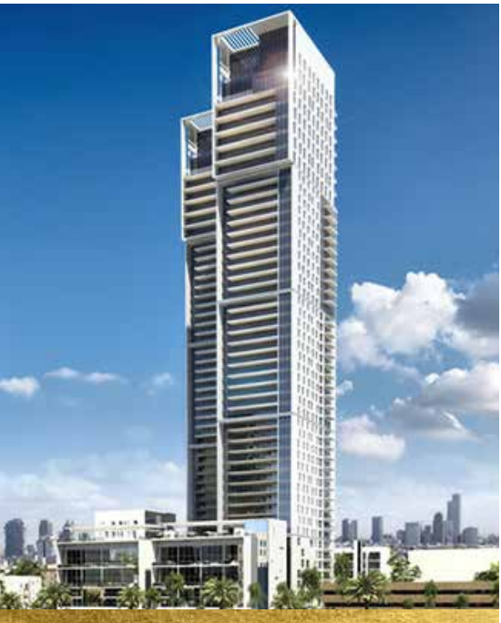
H - INFINITY TOWER